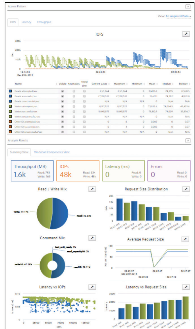
Figure 2: Screen shot of Workload Analyzer within Load DynamiX Enterprise.

Finally, the automated analysis aids in the creation of individual and composite storage workloads, useful for load generation and realistic simulation of workloads in the lab.